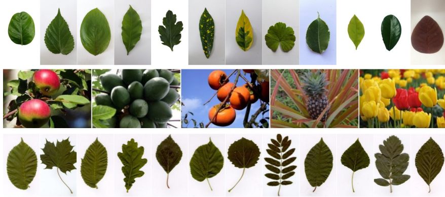
Fig. 1. Some example pictures from the three datasets in which we show one image per class for some classes in the datasets. From the top row to the bottom row we can see example images from the Folio, AgrilPlant, and Swedish datasets.