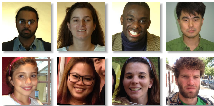
Fig. 1. An impression of the challenging task of face gender classification. Top row: face images from the color FERET dataset [5], [6]. Bottom row: face images from the Adience dataset [3]

The contributions of this paper. In order to investigate