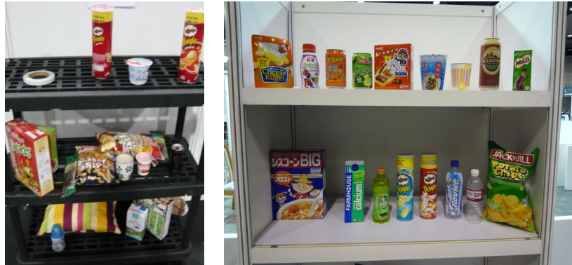
(a) Predefined objects in RoboCup 2009 (b) Predefined objects in RoboCup 2010

of predefined objects which the team did not choose.