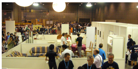
(i) RoboCup 2010 Singapore