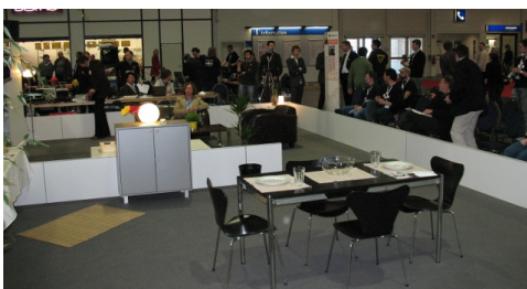
(e) RoboCup German Open 2008 Hannover