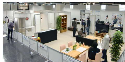
(h) RoboCup Japan Open 2010 Osaka