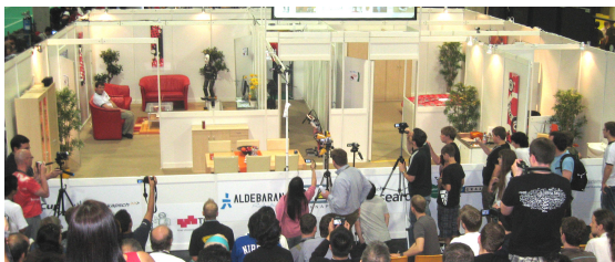
(g) RoboCup 2009 Graz