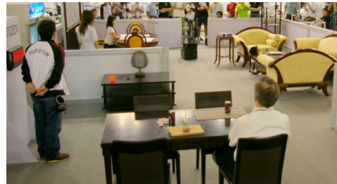
(f) RoboCup 2008 Suzhou